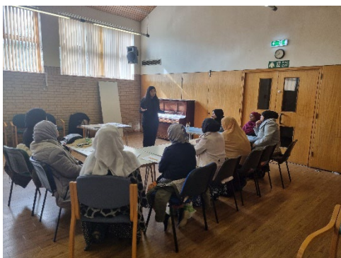
ESOL for women only.

We have worked with the NHS about Integrated Care partnership, the session was attended by Elders as they are most affected due to lack of access to health care and the NHS.