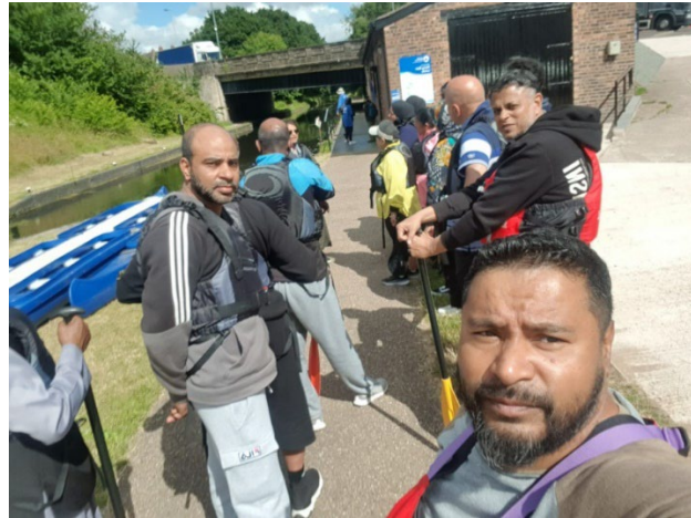
Mixed group Bell boating during the summer of 2022, with Canal and River Trust.