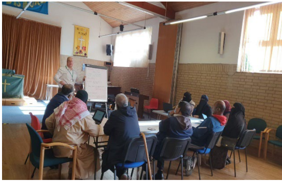
Our Mixed IT for beginners class.