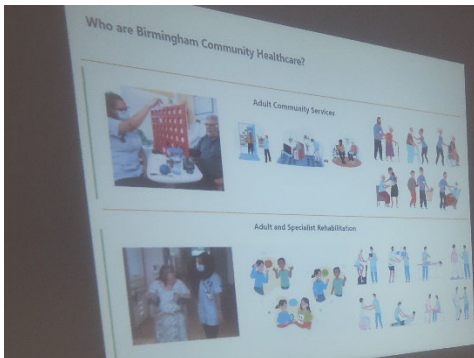
Discussion took place around what Services for the Elderly should be made available in the community.