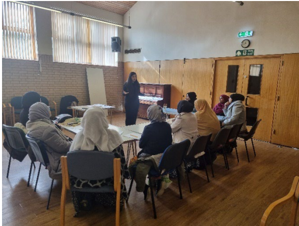
Women only ESOL session.