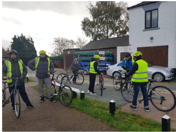
Men's Cycling Club (For Carers)