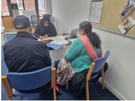
Advice Session appointment based.