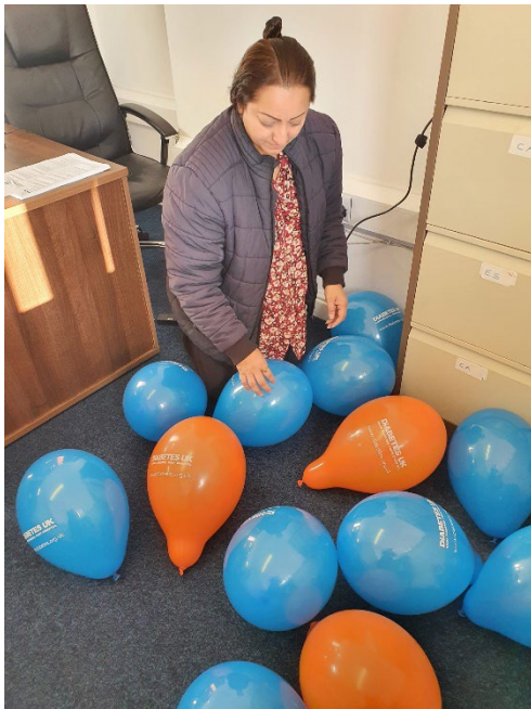
Getting Ready for our Diabetes awareness workshop