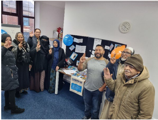
Diabetes myth busting sessions