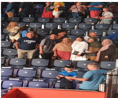
Trip to watch Squash at the 2022 Commonwealth Games, and visit Pollinations.