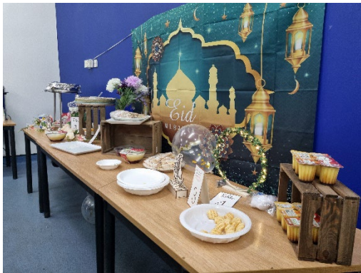
Eid party July 2022, Diwali party and Christmas party took place in 2022