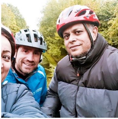
Mixed cycling group.