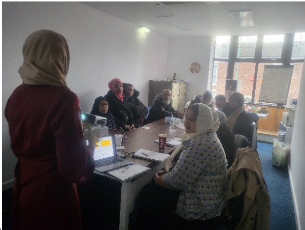
Session with NHS BCHC